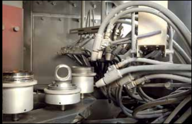
Indexing Turntable Machine coordinates 16 blast guns, oscillating vertically and horizontally, with rotating work stations to assure thorough cleaning in a single pass.