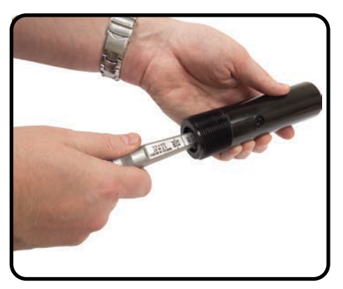
STEP 3: Insert the gauge into the threaded/inlet side of the nozzle until it stops and give it a couple of turns.

Copyright © 2013-2018 Pirate Brand®, All Rights Reserved