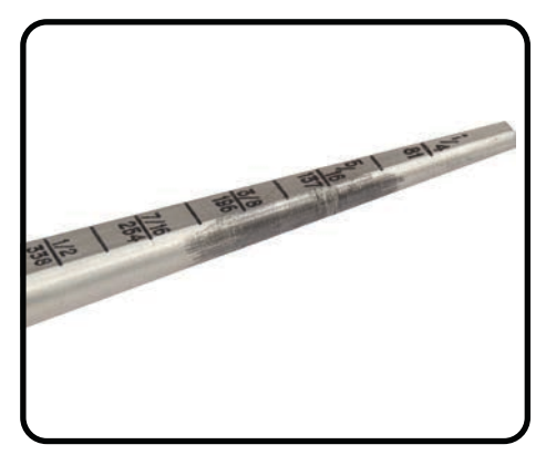
STEP 4: Remove the gauge and locate the mark <u>closest to the handle</u> where the nozzle rubbed off the marking pencil/crayon. This is the current ID of the nozzle bore.

Copyright © 2013-2018 Pirate Brand®, All Rights Reserved