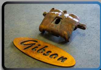
Part Surface Before & After Processing!