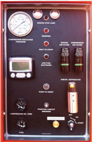
(Cummins Instrument Panel Shown)