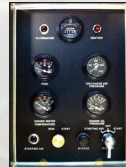
Model D185P JD/CA