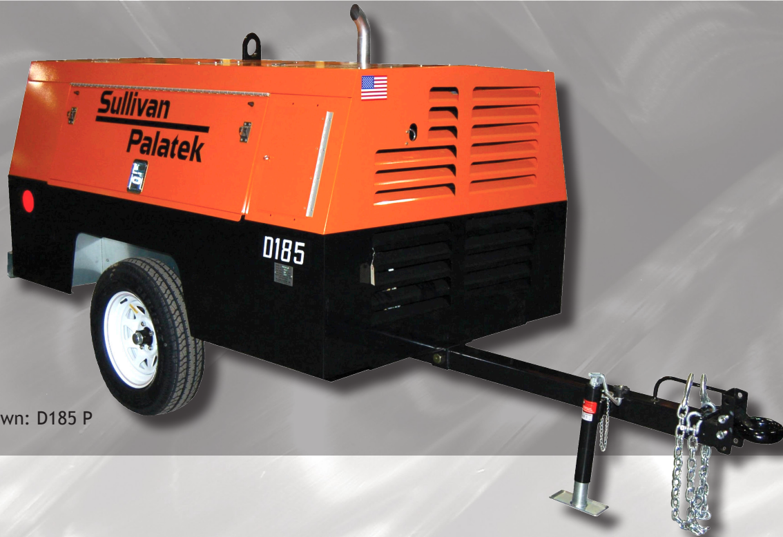
Model shown: D185 P