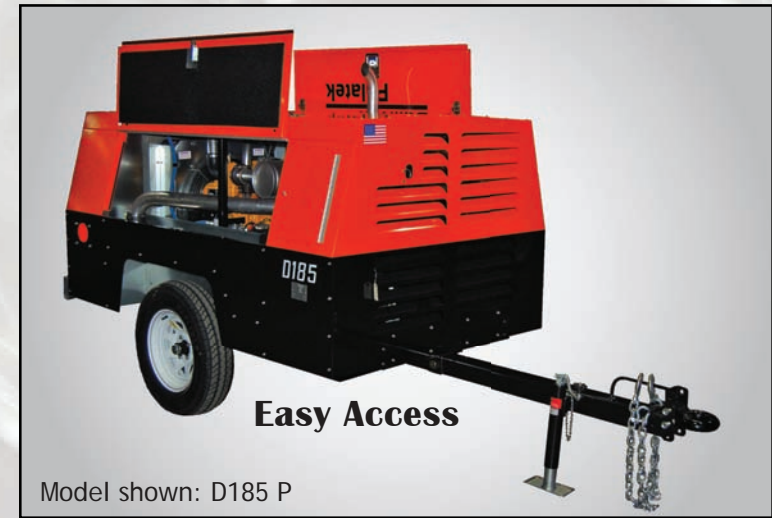
Model shown: D185 P

Our design features our advanced profile 108mm rotary screws for high efficiency.