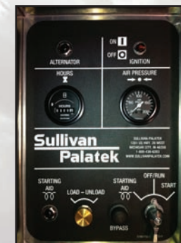
Model D185 P2 P3

Alternator warning light Hour meter Ignition on/off switch Discharge air pressure gauge Starting aid light Load unload selector switch Bypass button Start switch