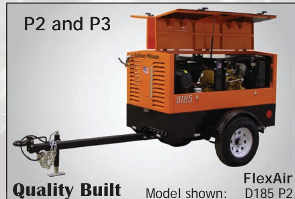
P2 and P3

Sullivan-Palatek manufactures air ends in our Michigan City plant to ensure complete control over assembly, quality and testing of all components. Oversized tapered roller bearings and other design features add to the quality of every Sullivan-Palatek machine. We offer a Three Year Unlimited Hour Air End Warranty on all of our machines.