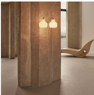
Set location - The Silo

Vilhelm Lauritzen (1894–1984) is one of the most significant architects in the history of Denmark; he was the trail-blazing figurehead of Danish functionalism. A number of his buildings – Nørrebro Theatre (1931–32), Daells Varehus department store (1928–35), Radiohuset (1936–41) and the first airport built in Kastrup (1937–39) – represented the concentrated essence of contemporary life.