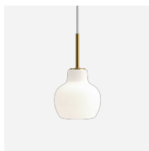
VL Ring Crown 1