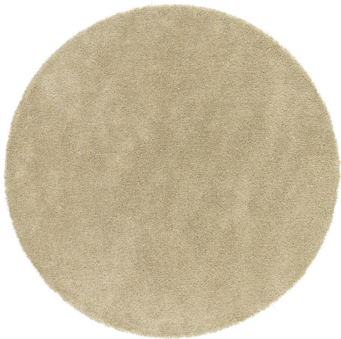
Rug Ø 240 cm, Oat Shine 802

Design GUNILLA LAGERHEM ULLBERG Hand tufted rug in pure wool and linen