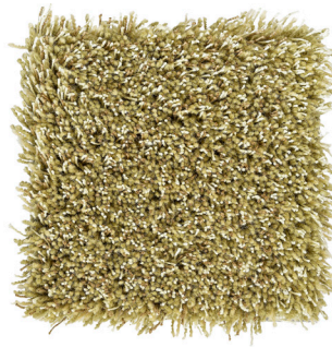
Lemon & Lime 306