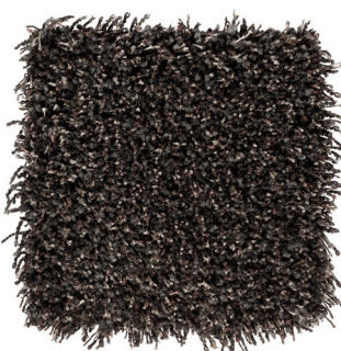
Black Bean 504