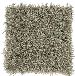
Silent Grey 803