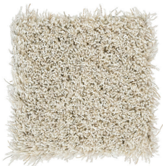
White Tea 120

Design GUNILLA LAGERHEM ULLBERG Hand tufted rug in pure wool and linen