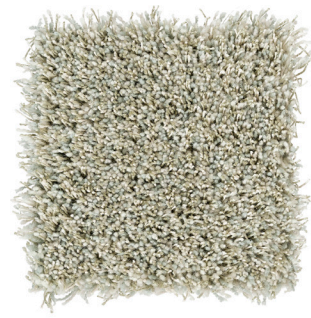
Silver Fern 505