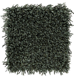
Green Shadow 305