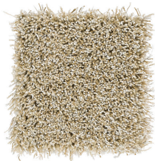
Oat Shine 802