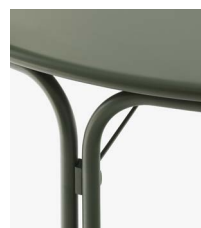
→ Bronze Green