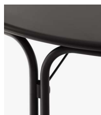
→ Warm Black