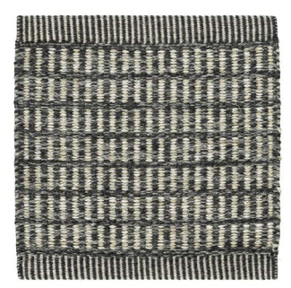
Grey Stone 589