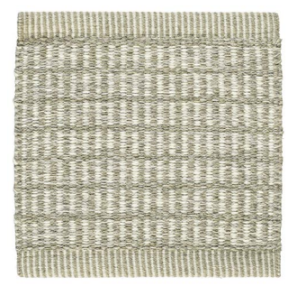
Linen Beige 882