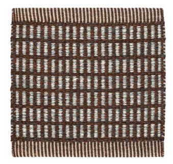
Redwood Haze 721