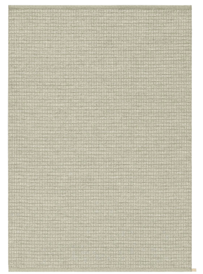
Rug 170x240 cm, Linen Beige 882