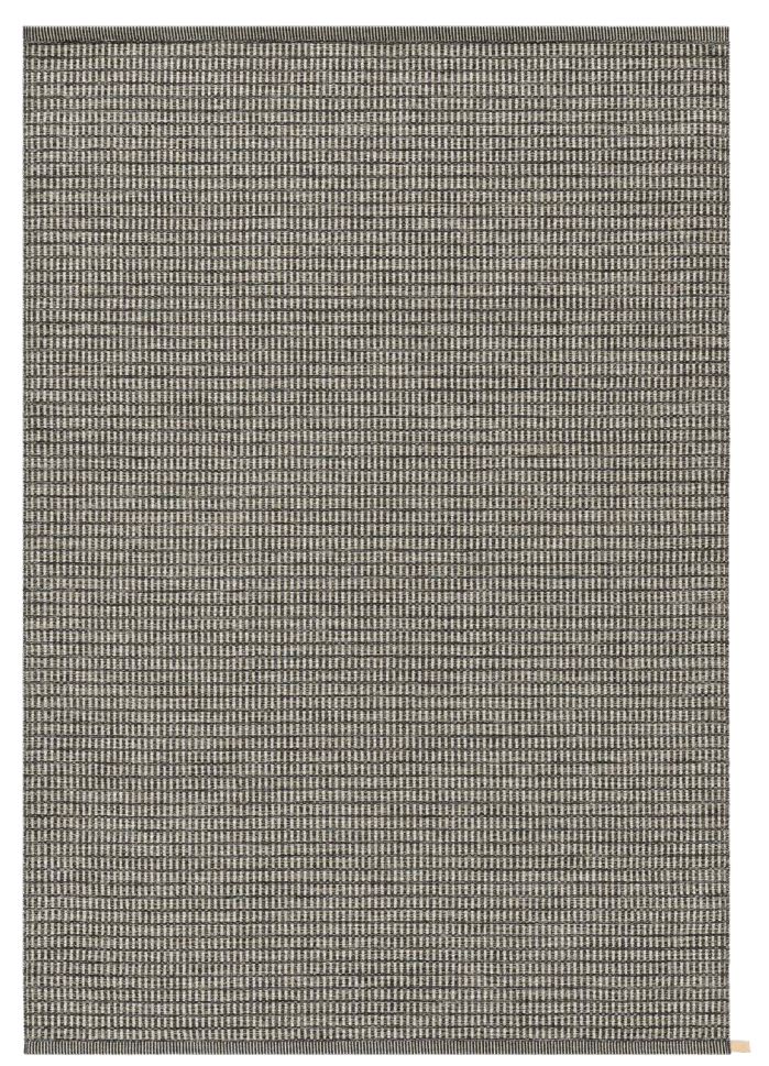
Rug 170x240 cm, Grey Stone 589