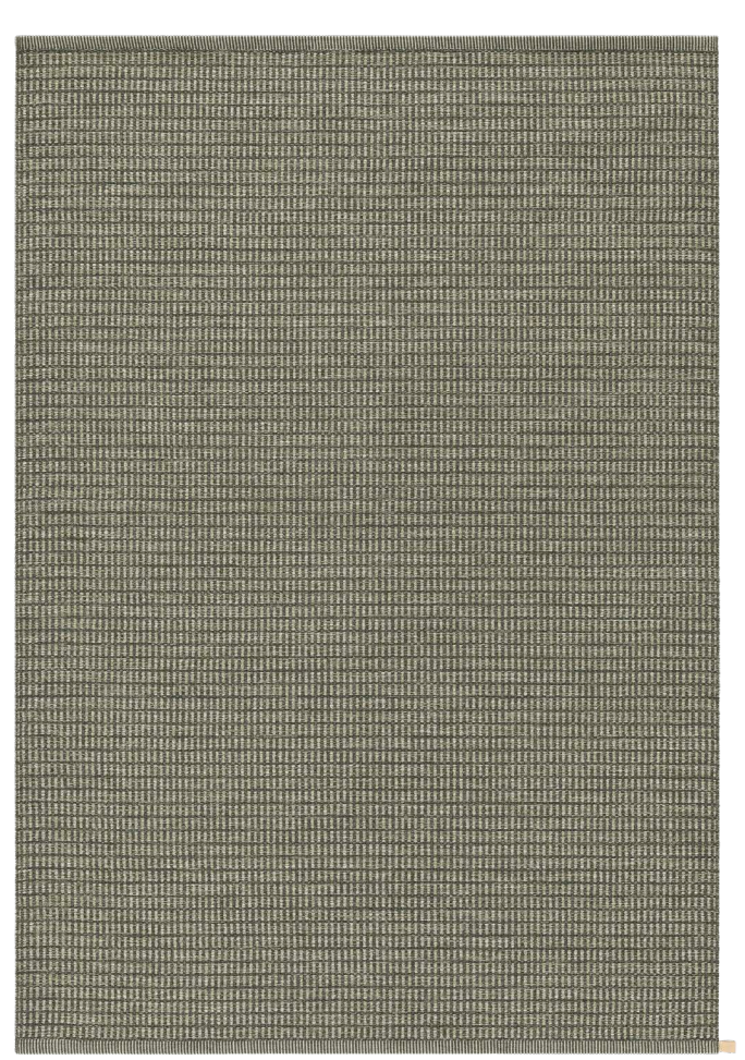
Rug 170x240 cm, Willow Green 585