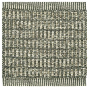
Willow Green 585