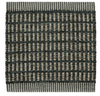
Evening Blue 586