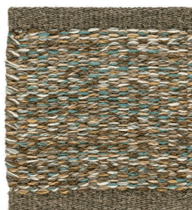
Autumn Bay 701