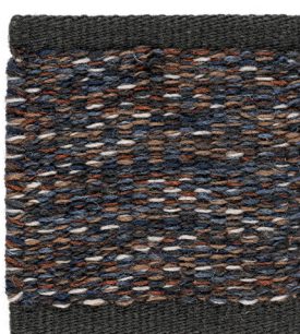
Black Forrest 203