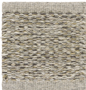
Pebble Grey 502