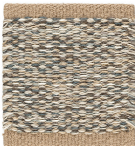
Tidal Foam 804