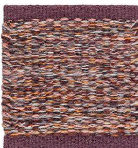
Nippon Rose 600