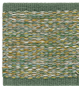
Summer Breeze 302