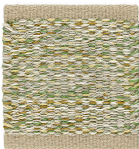
Early Spring 803