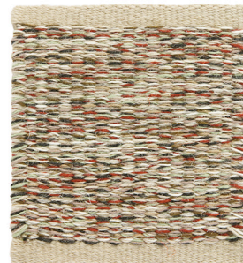
Multi Light 800