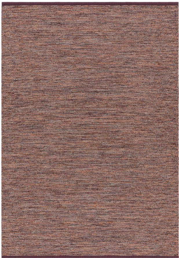
Rug 170x240 cm, Nippon Rose 600