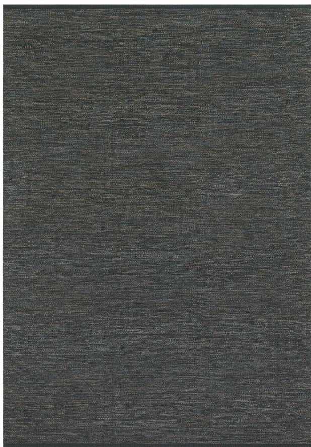
Rug 170x240 cm, Mountain Lake 202