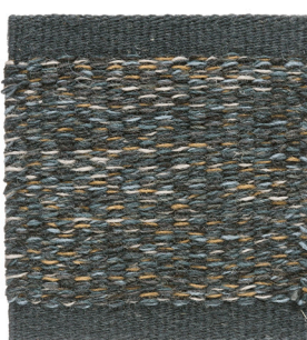
Mountain Lake 202