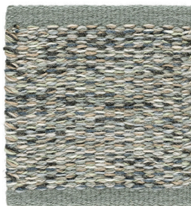
Winter Stream 204