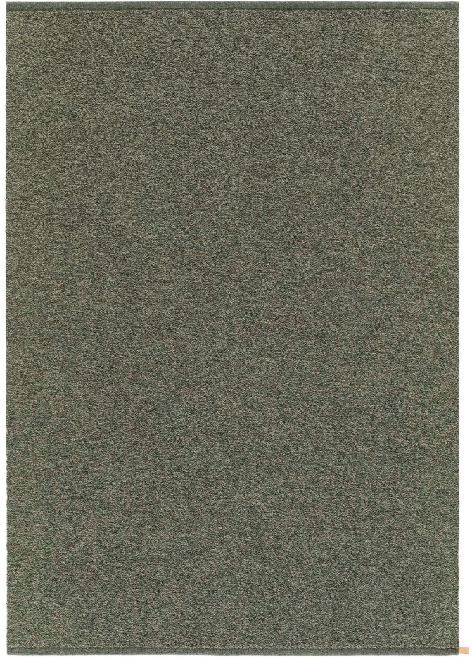
Rug 170x240 cm, Antique Grey 581