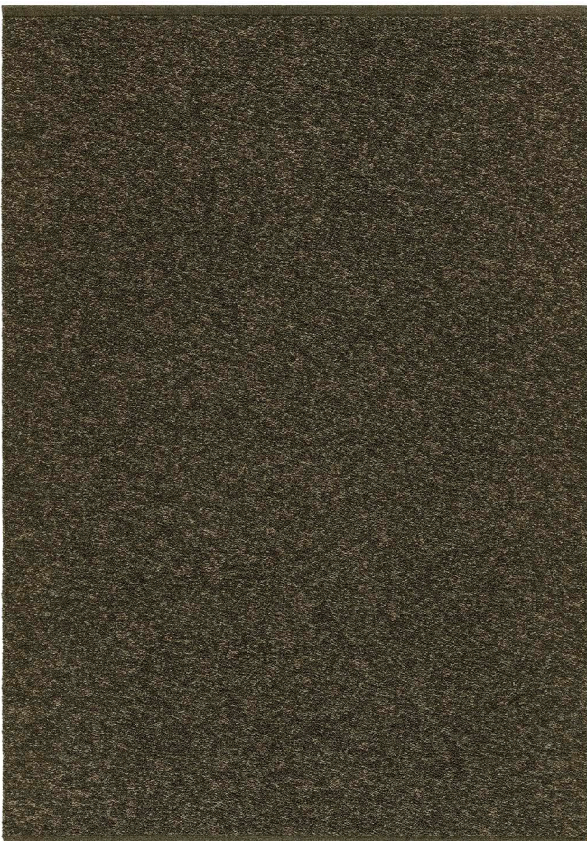
Rug 170x240 cm, Smokey Brown 781