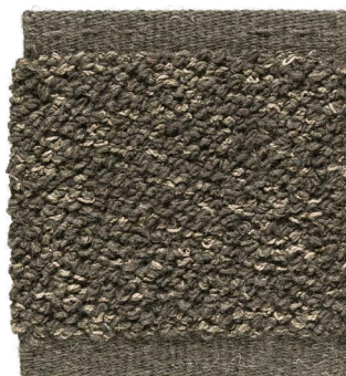
Smokey Brown 781