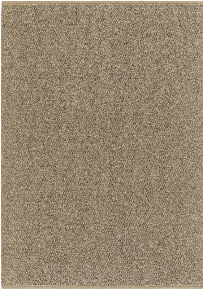
Rug 170x240 cm, Limestone Sand 881

Design GUNILLA LAGERHEM ULLBERG Woven bouclé rug in pure wool and linen