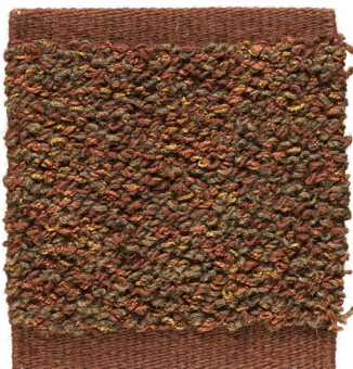
Deep Bronze 771