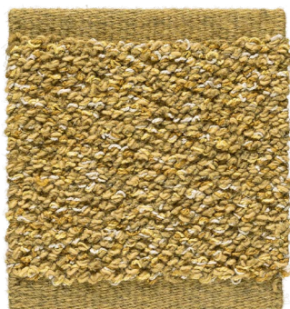
Sun Light 442