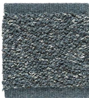
Skagen Blue 221