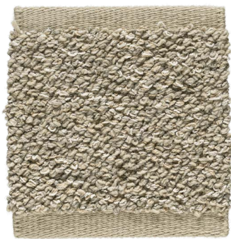
Limestone Sand 881

Design GUNILLA LAGERHEM ULLBERG Woven bouclé rug in pure wool and linen