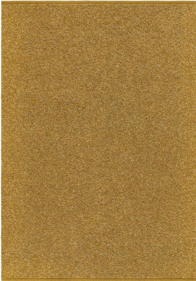
Rug 170x240 cm, Sun Light 442

Design GUNILLA LAGERHEM ULLBERG Woven bouclé rug in pure wool and linen