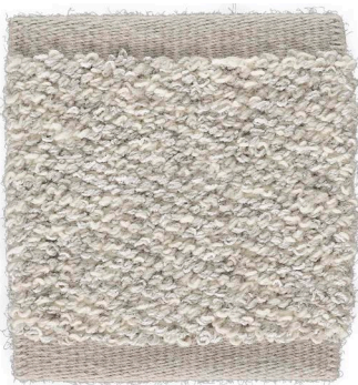
Soft Grey 850