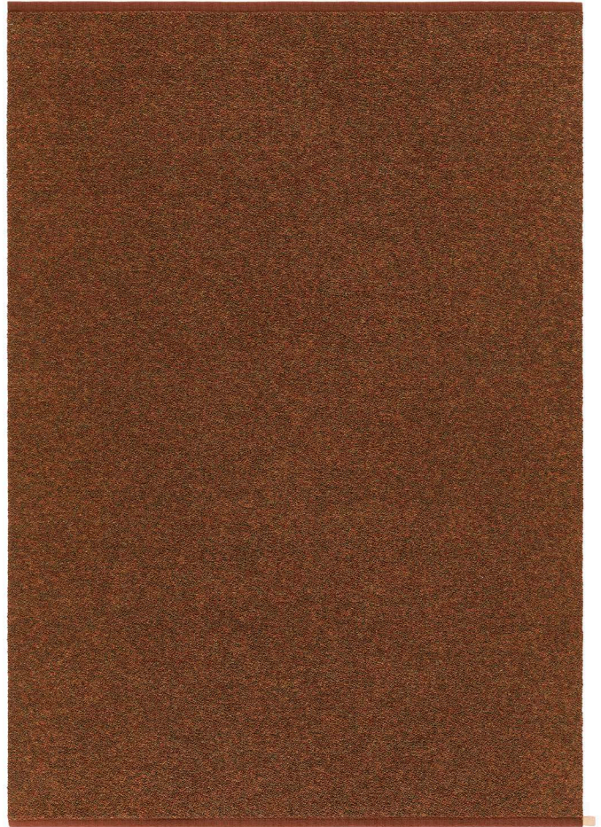
Rug 170x240 cm, Deep Bronze 771