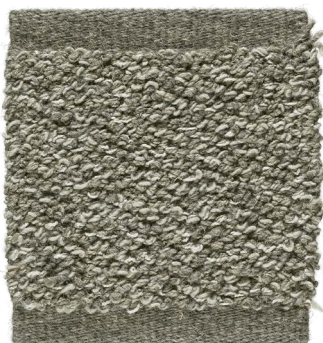
Antique Grey 581