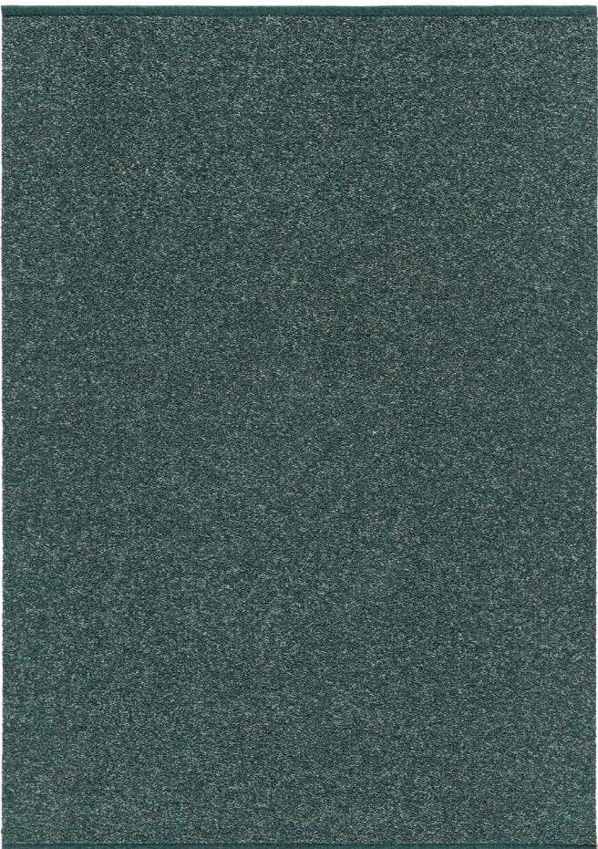
Rug 170x240 cm, Skagen Blue 221