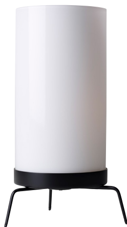
OPAL GLASS WITH BLACK LACQUERED STEEL BASE