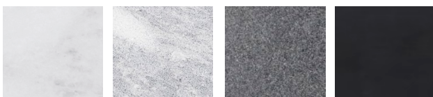
MARBLE (ROLLED) WHITE

The tabletop is available in following variants: