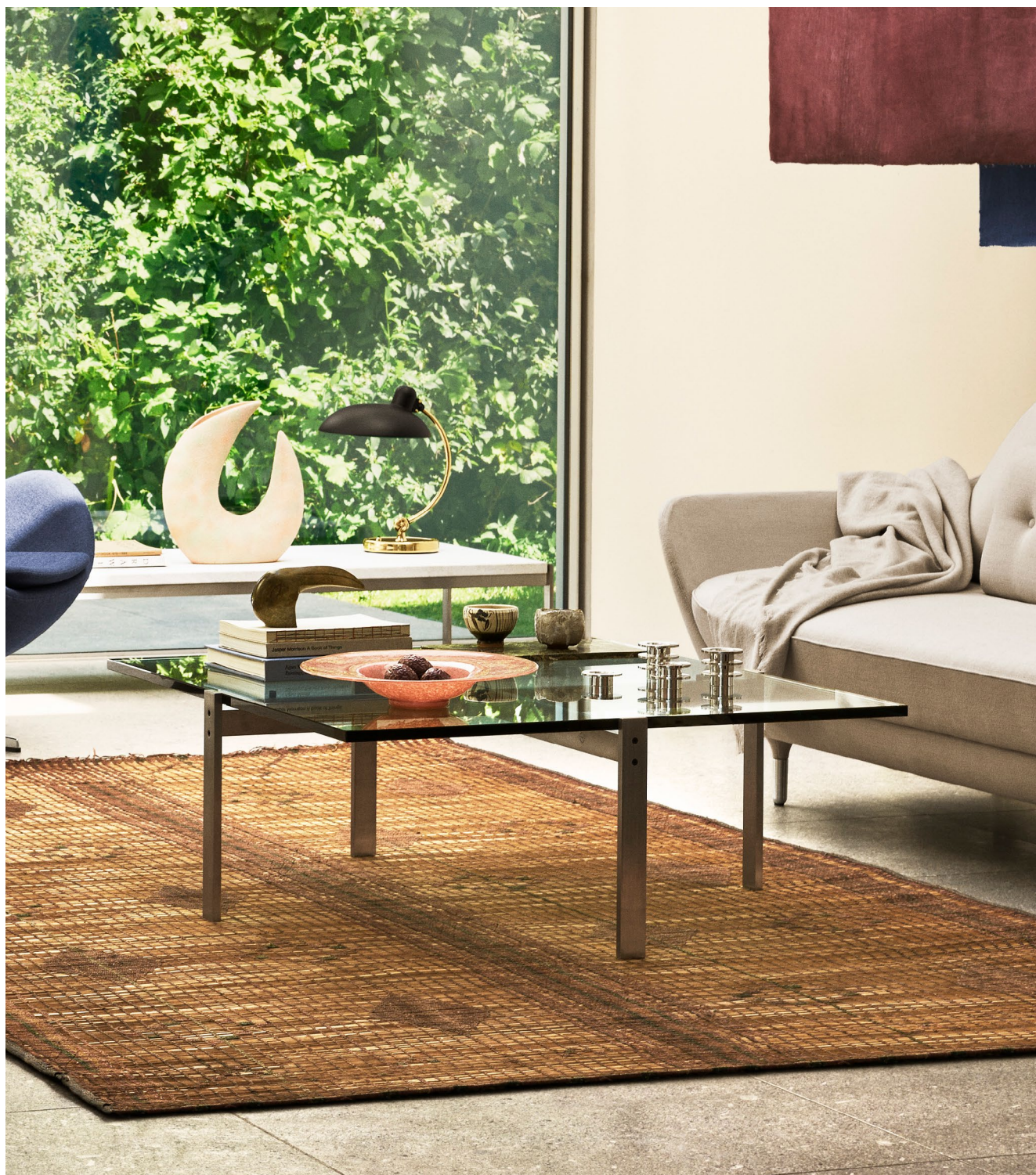
PK65™ PRODUCT FACT SHEET