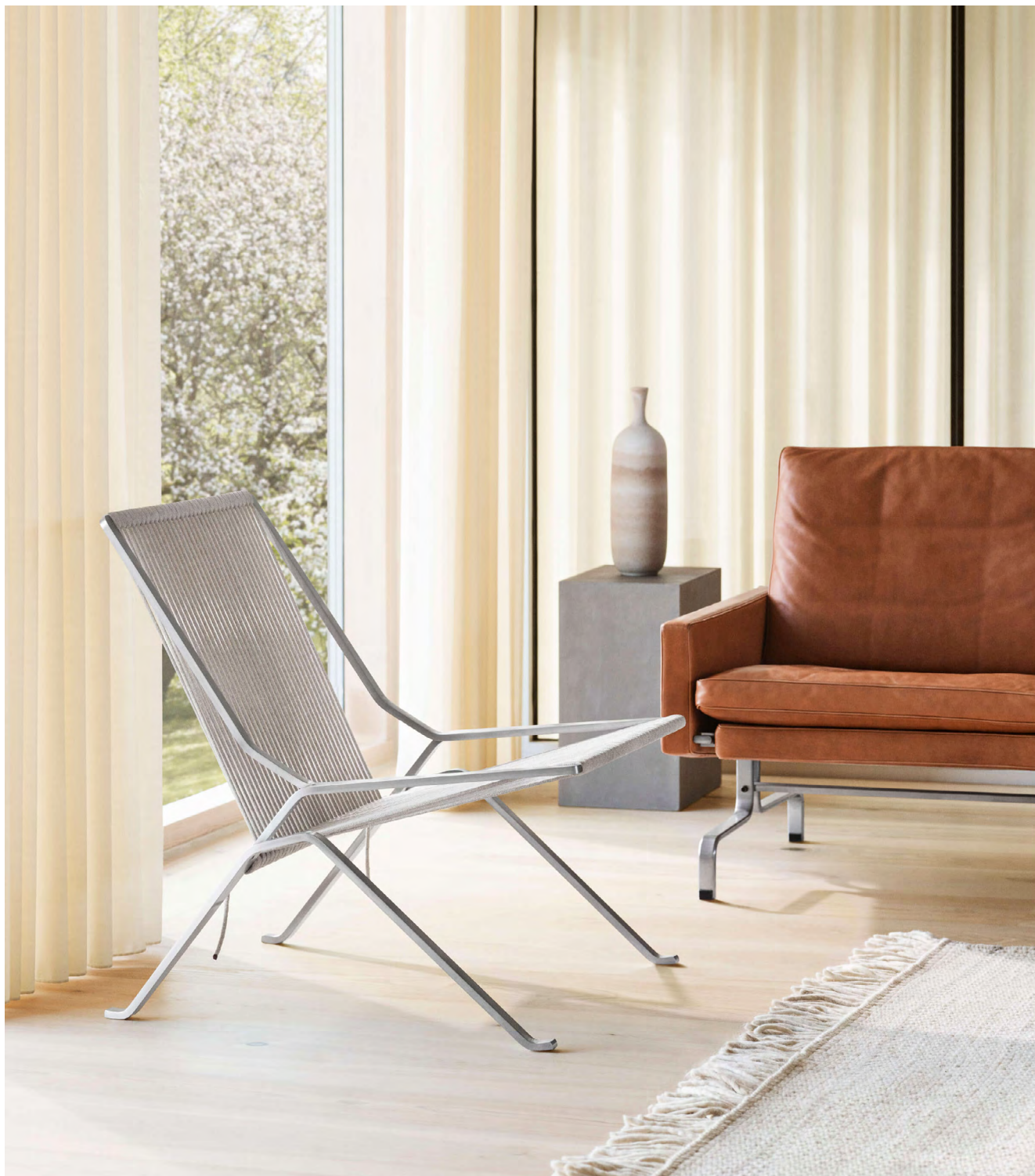
PK25™ PRODUCT FACT SHEET