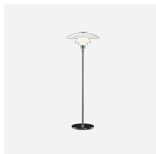
PH 4½-3½ Glass Floor