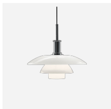
PH 4½-4 Glass Pendant