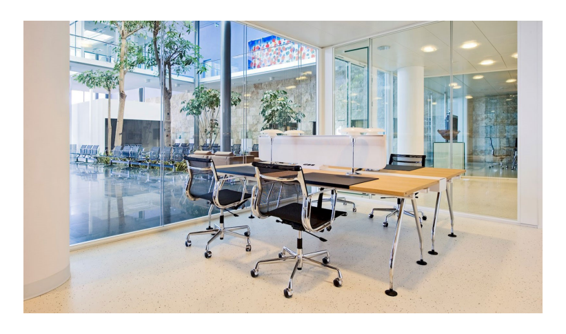
American Heart Institute