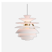
PH Snowball Anniversary Edition