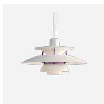
PH 5 Mini