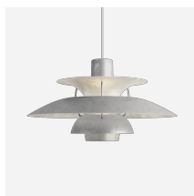
PH 5 Retake