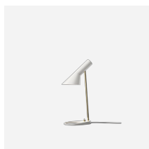
AJ Mini Anniversary Edition