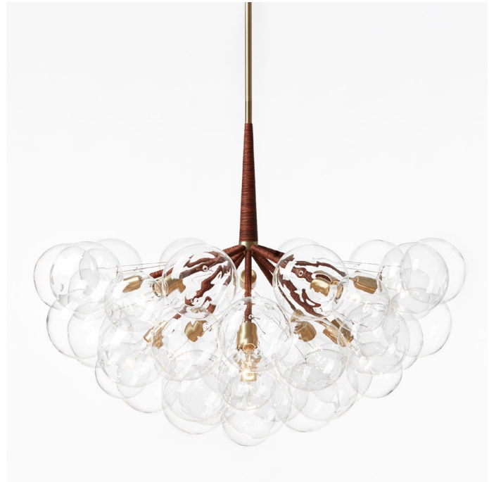
Supra Bubble Chandelier pictured with Satin Brass metal finish and Dark Brown Leather coiling