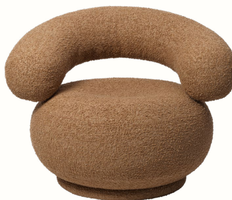
Orbo Lounge Chair

To see the specifications of each fabric and available colour assortment please go to the Fabric and Leather Overview