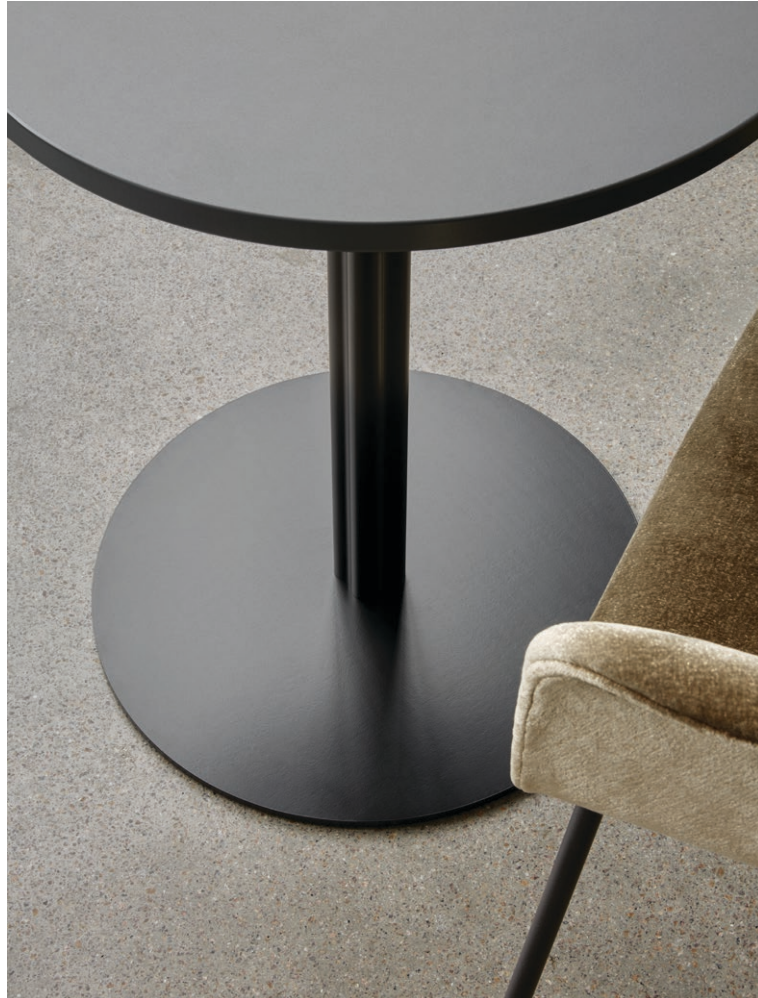
HARBOUR COLUMN DINING TABLE Designed by Norm Architects