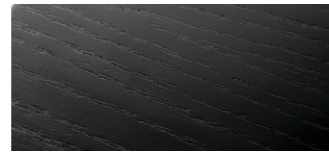
BLACK PAINTED OAK