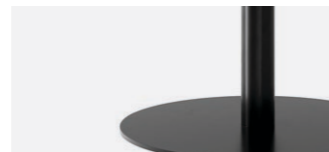
BLACK POWDER COATED ALUMINIUM & STEEL

Black powder coated aluminium and steel base with round or rectangular tabletop in Kunis Breccia stone, Estremoz marble, black painted oak or linoleum.