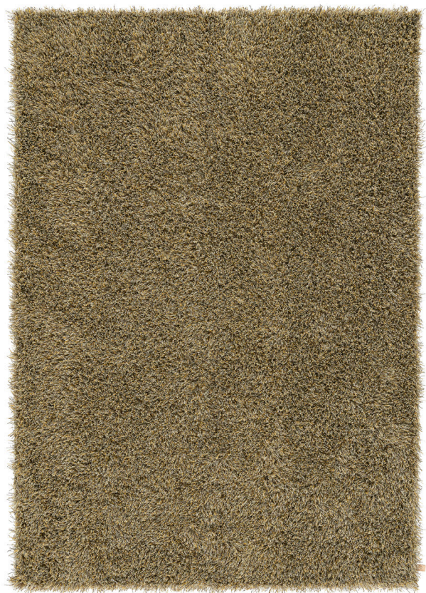
Rug 170x240 cm, Lemon Fudge 840