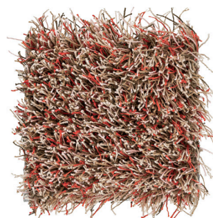
Almond Blush 810