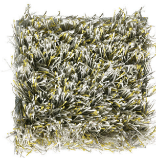
Grey Yellow 10