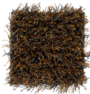
Copper Blue 820