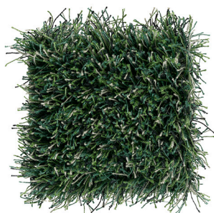
Sea Green 350