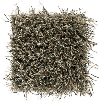
Lunar Beige 870