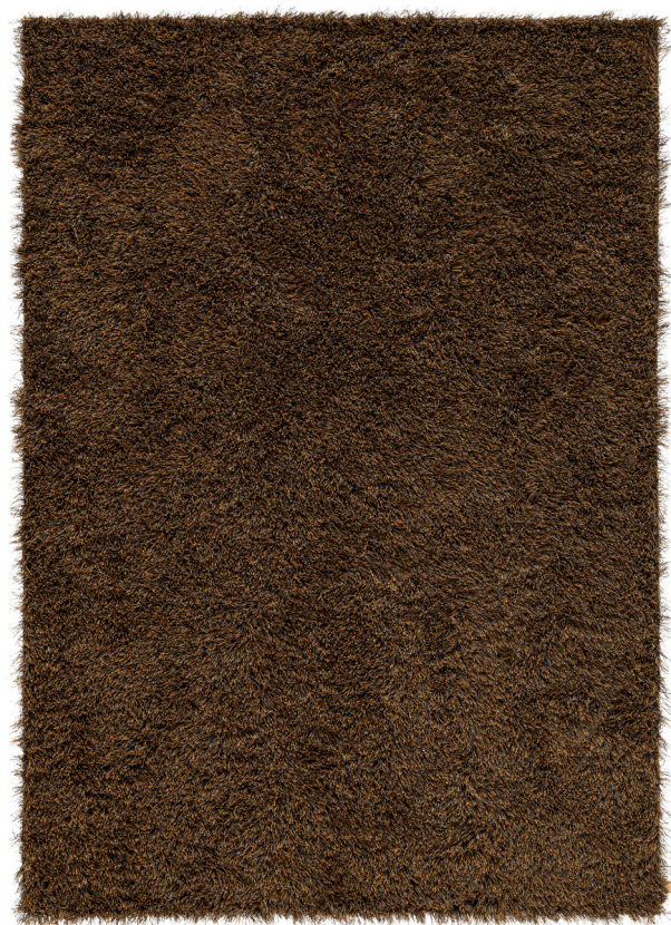
Rug 170x240 cm, Copper Blue 820