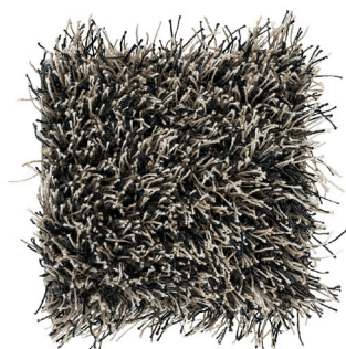
Mottled Black 580