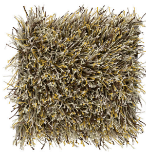
Lemon Fudge 840