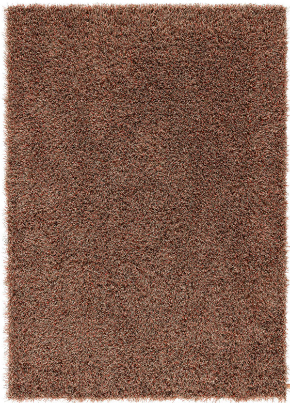
Rug 170x240 cm, Almond Blush 810