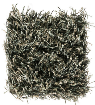
Dark Grey 1