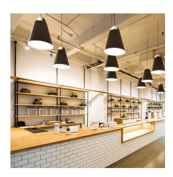
Set location: Alpha Dominche