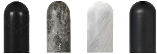
// Black marble // Grey marble // White marble // Blackened steel