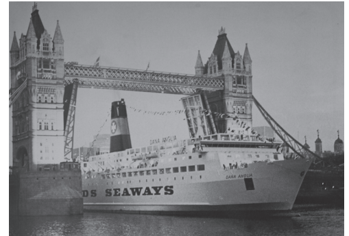
Dana Anglia - 1978

More than 30 years after the ferry's maiden voyage it has been renamed and upgraded several times and has sailed on a number of different routes between Denmark, the UK, France, the Netherlands, Poland, Norway and Sweden. Through all the years, the chairs have remained on board!