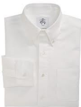
Long or short sleeved white or light blue button down collar oxford shirt (FOH or LE #458479)