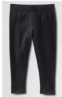
Navy Leggings (LE)