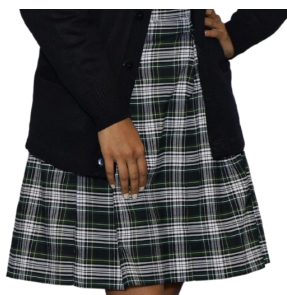
Plaid Skirt Style #34, Plaid #61, extra length* (FOH)

*The extra length should be ordered unless this would cause the skirt to fall well below the knee.