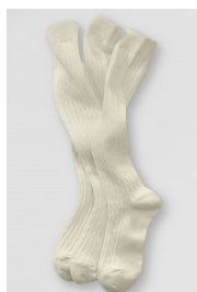
White or navy knee socks (any source)