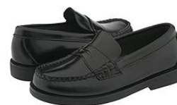
Dress shoes in black or brown. Solid black, brown, or navy socks (non-athletic)