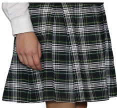
Plaid Skirt FOH Style #34, Plaid #61, extra length*

*The extra length should be ordered unless this would cause the skirt to fall well below the knee.