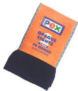
Navy opaque tights may be worn as daily wear.