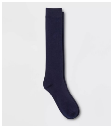
White or navy knee socks or white crew socks (any source). Crew socks must cover ankle.