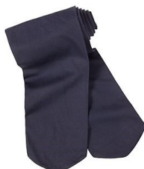
Navy opaque tights may be worn for daily wear.