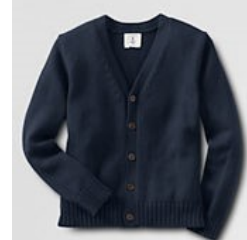
Navy button-front cardigan sweater (FOH #1001)