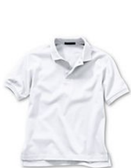
Cotton Polo, long or short sleeved, white or navy (LE or FOH)