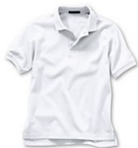
Cotton Polo, long or short sleeved, white or navy (LE or FOH)