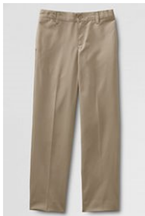
Khaki twill classics (FOH) or pleat or plain front chinos (LE)