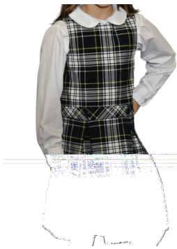
Plaid Jumper FOH Style #94, Plaid #45

Navy or black bike shorts worn under jumper for modesty (any source)