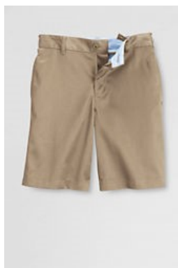
Khaki Short: Pleat or plain front (FOH or LE)

Shorts may be worn before November 1 and after April 15.