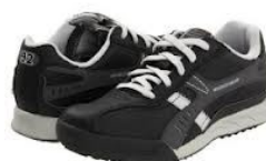
Solid or mostly white or black sneakers-no gray (any source). No neon on shoes or soles