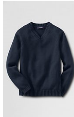
Navy V-Neck Sweater (FOH or LE)