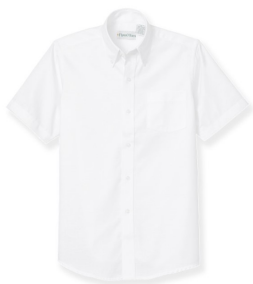
Short Sleeved Oxford Cloth Blouse (white)