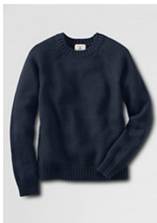
Navy Crew Neck Sweater (FOH or LE) Sweaters should be worn over a uniform shirt.