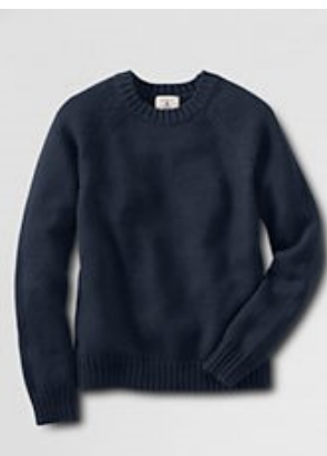
Navy Crew Neck Sweater (FOH #6530 )

Sweaters should be worn over a uniform shirt.