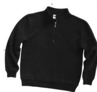
Navy Fleece Jacket: Full or half zip. Must have school logo (LE). Please note that only the new logo will now be accepted. Fleece may be worn in the classroom.

Shorts may be worn before November 1 and after April 15.