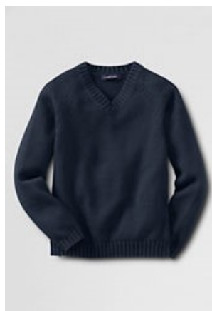
Navy V-Neck Sweater (FOH or LE) Sweaters should be worn over a uniform shirt.