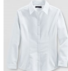
Oxford Cloth Shirt, white, long sleeved (any source)