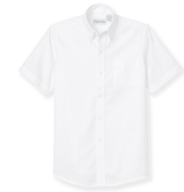
Short Sleeved Oxford Cloth Blouse (white)