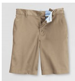
Khaki Short: Pleat or plain front (FOH or LE)

Boys may wear shorts before November 1 and after April 15.