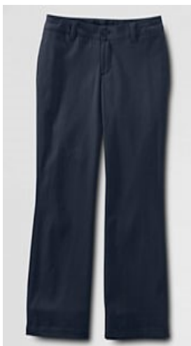
Classic navy plain or pleated front chinos (LE) Pants may be worn November 1-April 15.