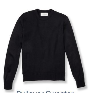
Pullover Sweater White/Navy/Gray/Light Blue