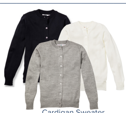
Cardigan Sweater White/Navy/Gray/Light Blue