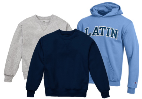
Crewneck & Hooded Sweatshirts White/Navy/Gray/Light Blue