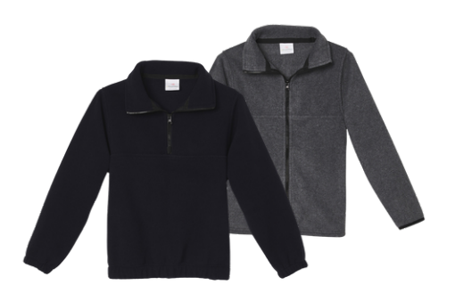
1/4 & Full Zip Sweatshirts White/Navy/Gray/Light Blue