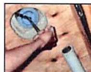
Photograph of tool is gray to show detail of tool in use. Actual tool color is black.

73055 Razorback Wrench - boxed 5 5.0 lbs.