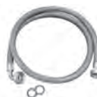
With 90° Elbow