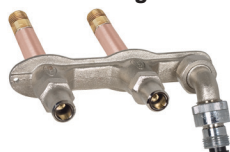
C-208 Loose Key Design