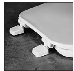
"LOCKED-IN" TOP-TITE® HINGE