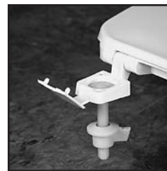
TOP-TITE® HINGES WITH BOLT AND WING NUT

Ring thickness is 3/8" Ring thickness including the bumper is 5/8" Height of the seat with cover is 1-1/2"