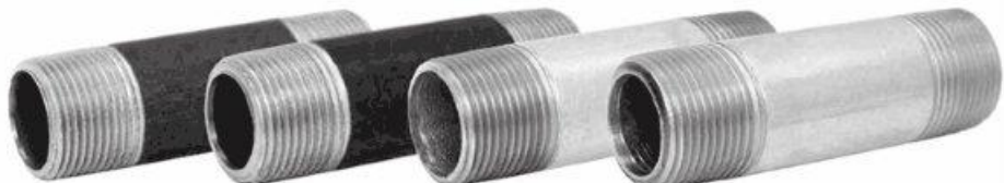
FIG. 339: Standard Black Schedule 40