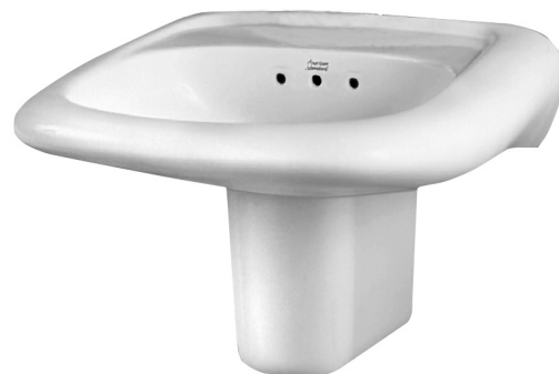
Shown with 0059.020EC shroud