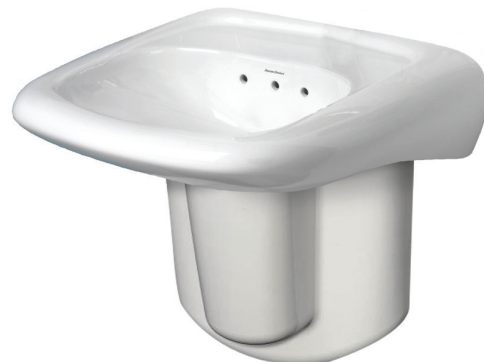
Shown with 0062.000EC shroud