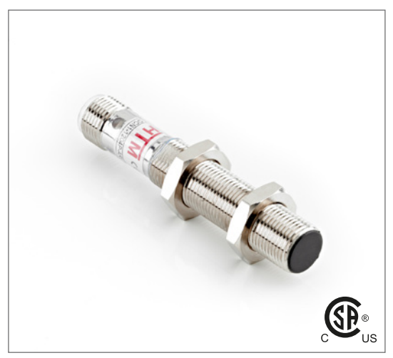
Note: The product images shown may change over time as products are updated.