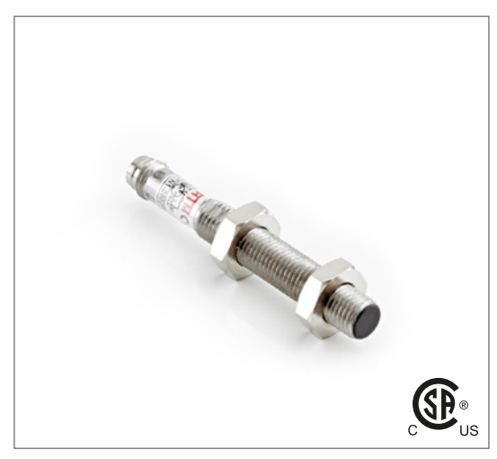
Note: The product images shown may change over time as products are updated.