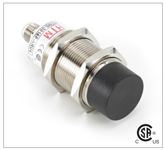
Note: The product images shown may change over time as products are updated.