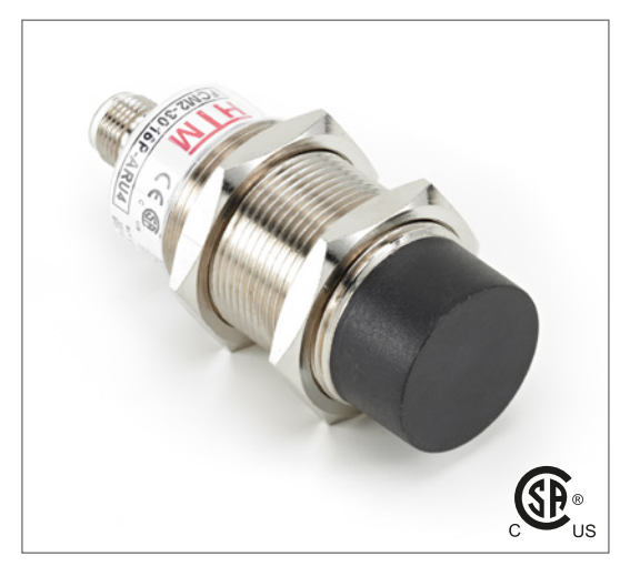
Note: The product images shown may change over time as products are updated.