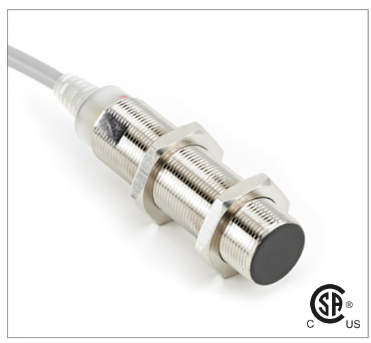
Note: The product images shown may change over time as products are updated.