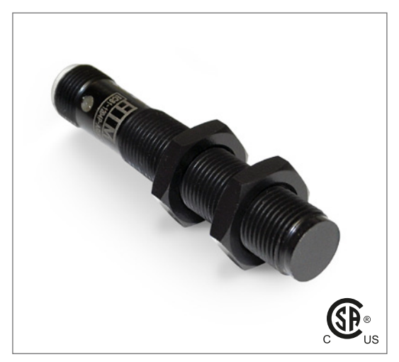
Note: The product images shown may change over time as products are updated.