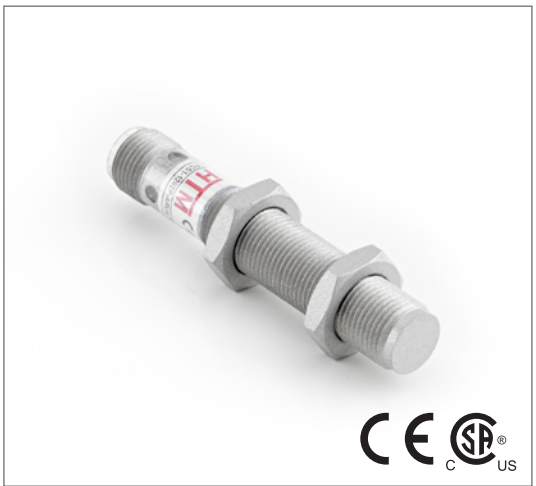
products are updated.