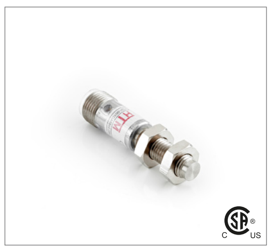
Note: The product images shown may change over time as products are updated.