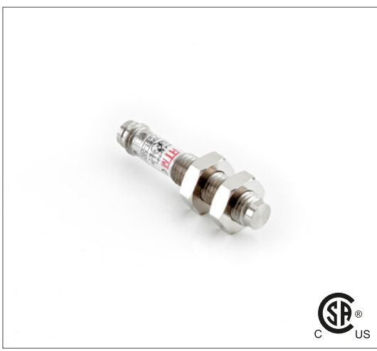
Note: The product images shown may change over time as