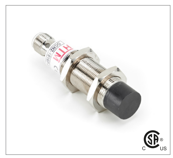
Note: The product images shown may change over time as products are updated.