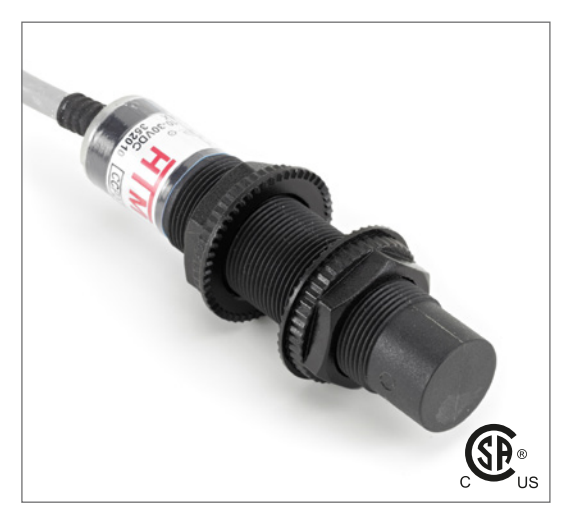
Note: The product images shown may change over time as products are updated.