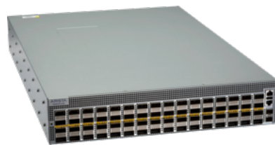
Arista 7060DX5-64S: 64 x 400GbE QSFP-DD ports, 2 SFP+ ports