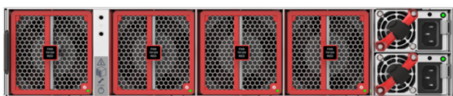
Arista 7060X5 2RU Rear View: Front to Rear airflow (red) AC Powered