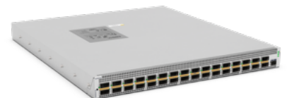
Arista 7060DX5-32: 32 x 400G QSFP-DD ports, 1 SFP+ port