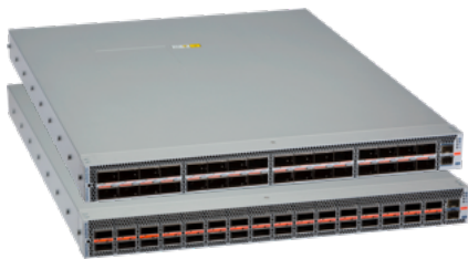
Arista 7060X5-64: 32 x 800G QSFP-DD & OSFP ports, 2 SFP+ ports

The 7060CX5-56D8 delivers 56 100G ports and 8 400G ports in a 2RU system with an overall throughput of 8.8 Tbps. The 7060CX5-56D8 supports QSFP-DD interfaces supporting industry standard optics and cables allowing for ease of migration to 400G. Ports allow a choice of speeds including 400GbE (on the QSFP-DD ports) or 100GbE or 25GbE (on the QSFP100 ports) up to 128 interfaces.