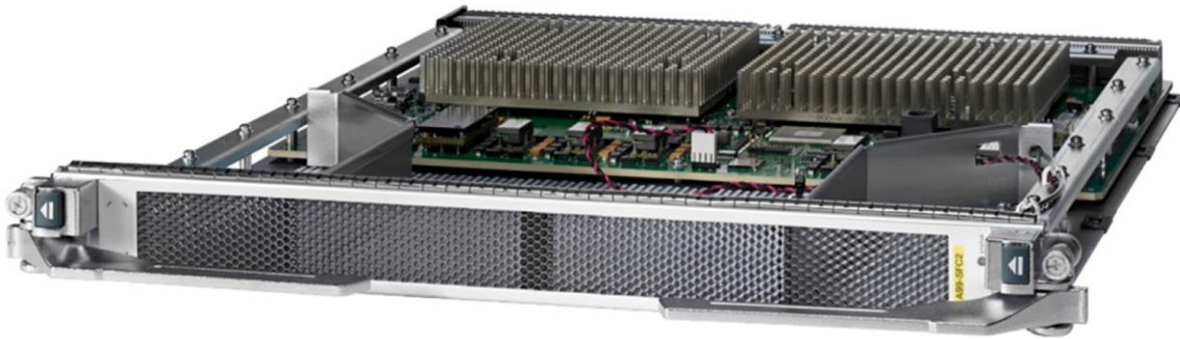
Figure 1. Cisco ASR Switch Fabric Card 2

The Cisco ASR 9900 Switch Fabric Card 2 (Figure 1), Switch Fabric Card S (Figure 2) and Switch Fabric Card T (Figure 3) are the next-generation switch fabrics for the Cisco ASR 9922 Router, ASR 9912 Router, ASR 9910 Router and ASR 9906 Router, supporting high-density 100 Gigabit Ethernet line cards. The system architecture of the Cisco ASR 9900 Switch Fabric Card 2 (ASR 9900 SFC2), Switch Fabric Card S (ASR 9900 SFC-S) and Switch Fabric Card T (ASR 9900 SFC-T) is designed to accommodate new programmable deployment models and convergence of Layer 2 and Layer 3 services, as required by today's wireline, Data-Center-Interconnect (DCI), and Radio Access Network (RAN) aggregation applications.