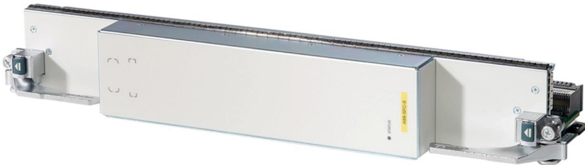
Figure 2. Cisco ASR Switch Fabric Card S