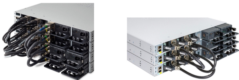
Figure 5. Cisco Catalyst 9300 Series modular uplink models stack (C9300/C9300X SKUs) and fixed uplink models stack (C9300L SKUs).

Cisco Catalyst 9300 Series Switch models are designed for stacking as a single virtual switch, enabling customers to have a single management plane and control plane for up to 448 access ports.