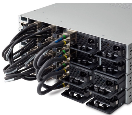
Figure 7. Cisco Catalyst 9300 Series StackPower