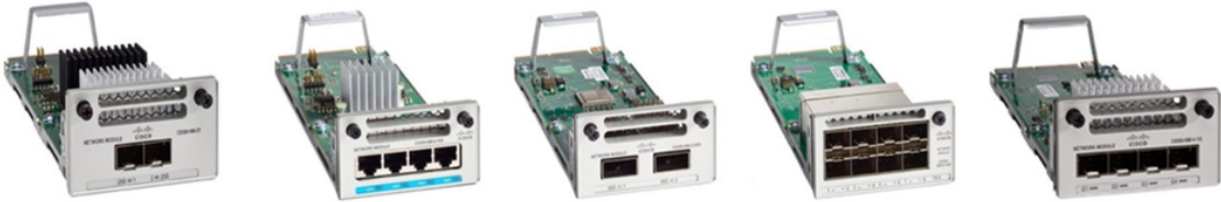
Figure 3. Cisco Catalyst 9300 Series network modules