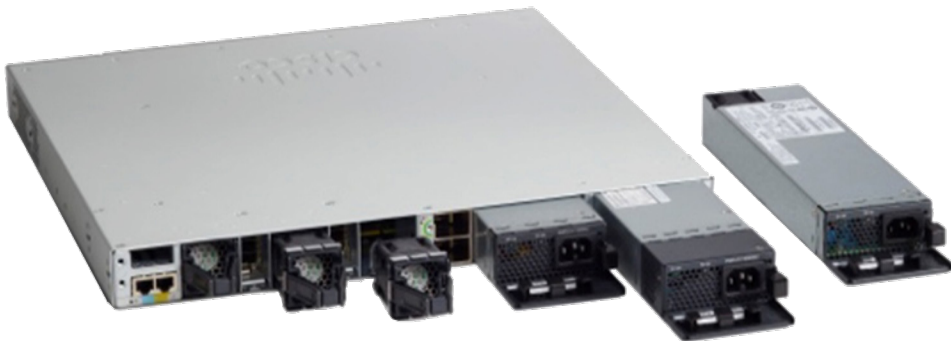
Figure 4. Cisco Catalyst 9300 Series dual redundant power supplies

Table 4 lists the different power supplies available in these switches and available PoE power.