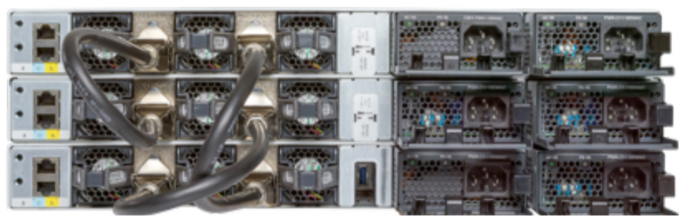
Figure 6. Cisco Catalyst 9300 Series fixed uplink models with optional stack kit

Cisco Catalyst 9300 Series Switches also come with three field-replaceable fans and support (N+1) redundancy. Table 7 lists the fan module part number.