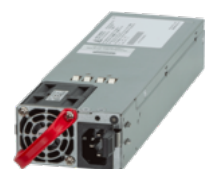
2.4kW Hot swap power supplies