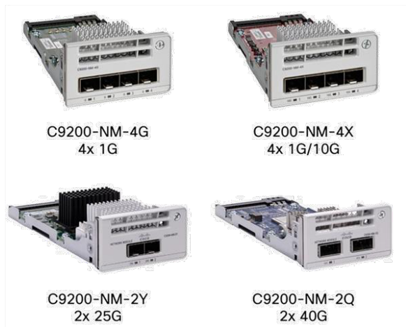
Figure 2. Cisco Catalyst 9200 Series Switch network modules

Cisco Catalyst 9200 Series switches come with modular or fixed uplinks as indicated in Table 1. With modular SKUs, the field-replaceable network modules provide infrastructure investment protection by allowing a nondisruptive migration from 1G to 10G and beyond. When you purchase the switch, you can choose from the network modules described in Table 3.