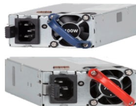
Hot swap power supplies