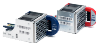
Hot swap fan modules