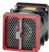
2U Hot swap fan modules