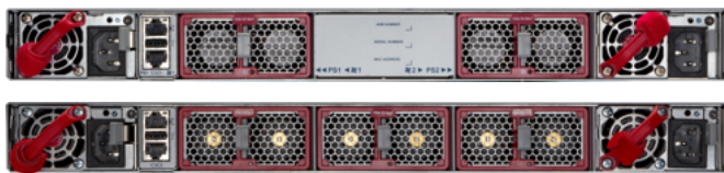
Arista 7280R3 1RU Rear View: Front to Rear airflow (red) AC Powered