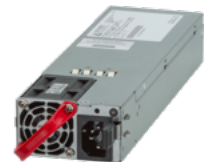
1500W Hot swap power supplies