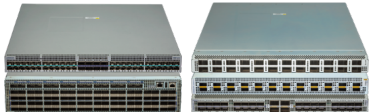
Arista 7280R3 Series

7280R3 support for 100G QSFP incorporates a flexible choice of interface speed including 25G and 50G providing unparalleled flexibility and the ability to seamlessly transition data centers to the next generation of Ethernet performance. The 7280R3 Series provide industry leading power efficiency with airflow choices for back to front, or front to back. An optional built-in SSD supports advanced logging, data captures and other services directly on the switch. Combined with Arista EOS the 7280R3 Series delivers advanced features for big data, cloud, virtualized and traditional designs.