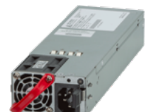
2.4kW Hot swap power supplies